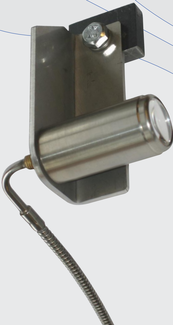
G2000 AOMD Fiber Optic Mini Head

The G 2000 AOMD is a line-of-sight opacity meter. It sends a high -power infrared beam of light across the section to be monitored. If the beam along the line of sight passes through oil mist, smoke, or dust, this light beam is scattered and absorbed and thus the receiver signal is reduced. The monitoring unit monitors the translucency, then inverting the signal for the display of opacity. The alarms will activate if the opacity exceeds the preset limits.