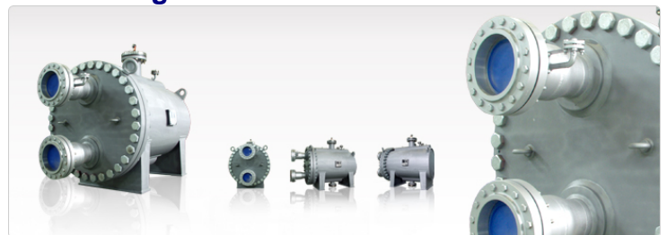
Plate Type Fresh Water Generator

Stainless steel grade, Titanium & T1 Alloy, Nickel & N1 Alloy, 6 moly and high alloy with excellent resistance